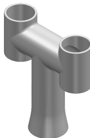
ISOMETRIC VIEW 1:20

OPEN-TOPPED FLUE TERMINAL TO BS EN 13502 - TYPE 0