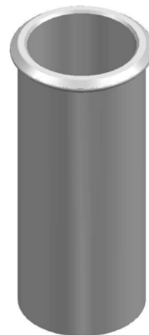
ISOMETRIC VIEW 1:10

OPEN-TOPPED FLUE TERMINAL TO BS EN 13502 - TYPE 0