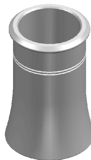
ISOMETRIC VIEW 1:10

OPEN-TOPPED FLUE TERMINAL TO BS EN 13502 - TYPE 0