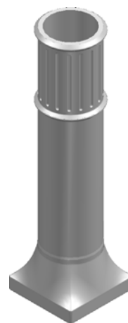
ISOMETRIC VIEW 1:20

OPEN-TOPPED FLUE TERMINAL TO BS EN 13502 - TYPE 0