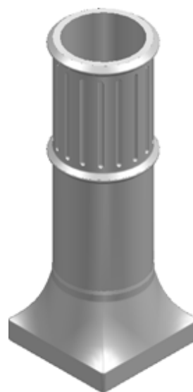
ISOMETRIC VIEW 1:20

OPEN-TOPPED FLUE TERMINAL TO BS EN 13502 - TYPE 0