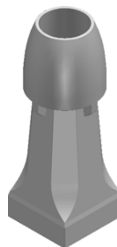
ISOMETRIC VIEW 1:20

OPEN-TOPPED FLUE TERMINAL TO BS EN 13502 - TYPE 0