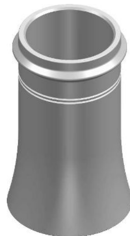
ISOMETRIC VIEW 1:10

OPEN-TOPPED FLUE TERMINAL TO BS EN 13502 - TYPE 0