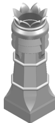
ISOMETRIC VIEW 1:20

OPEN-TOPPED FLUE TERMINAL TO BS EN 13502 - TYPE 0