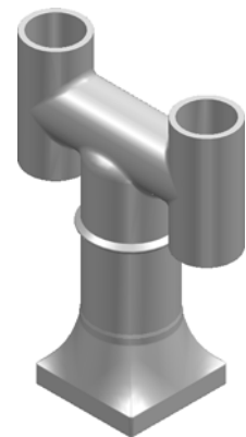
ISOMETRIC VIEW 1:20

OPEN-TOPPED FLUE TERMINAL TO BS EN 13502 - TYPE 0