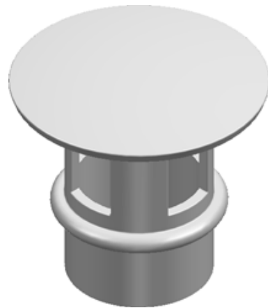
ISOMETRIC VIEW 1:10

RESTRICTED FLUE TERMINAL TO BS EN 13502 - TYPE 1