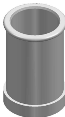
ISOMETRIC VIEW 1:10

OPEN-TOPPED FLUE TERMINAL TO BS EN 13502 - TYPE 0