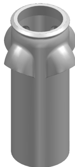
ISOMETRIC VIEW 1:10

OPEN-TOPPED FLUE TERMINAL TO BS EN 13502 - TYPE 0